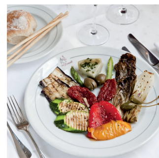
Restaurant Chez Donati