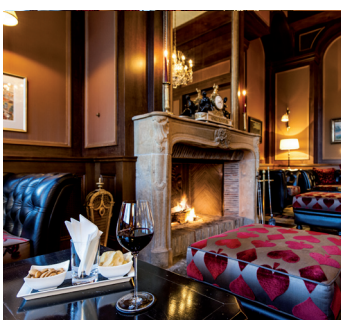
Bar Les Trois Rois

A celebration with family and friends, a fairy tale wedding or a business meeting: the magnificent “Salle Belle Epoque” ballroom, seven well-appointed conference rooms and its premier location make the Grand Hotel Les Trois Rois the ideal venue for any type of social or corporate event. Large windows enhance your meeting with plenty of natural light; elegantly furnished rooms with air-conditioning and latest state-of-the-art technology help ensure a successful and productive event. Whatever the occasion, our professional and devoted staff will assist you every step of the way and provide every touch to make your event beyond perfect.