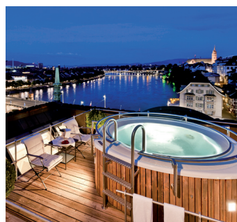
Whirlpool Les Trois Rois Suite