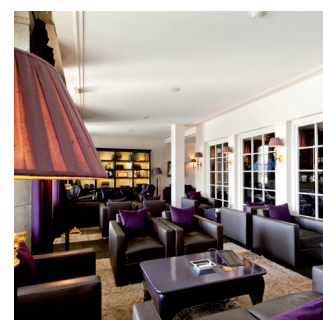
Salon du Cigare