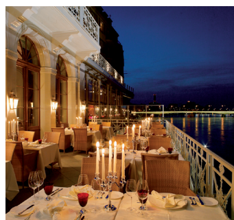
Restaurant Cheval Blanc