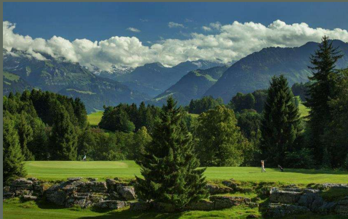
BÜRGENSTOCK ALPINE GOLF